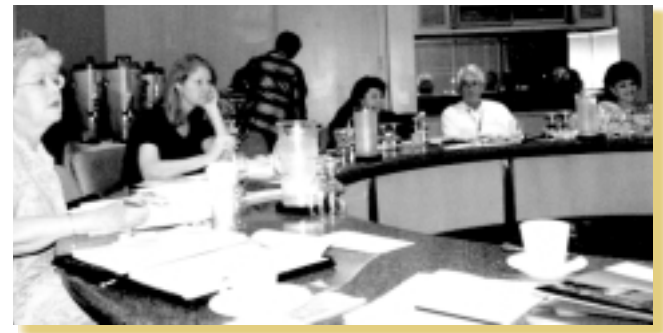
PHA Conference Committee hard at work.

More details will be in later issues of Pathlight . Members can expect conference registration packets to arrive early next year. There will also be a form at the PHA website that you can print, fill out, and mail so keep checking at www.phassociation.org .