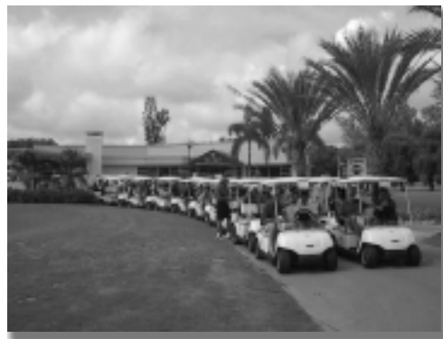
Lined up and ready to go!