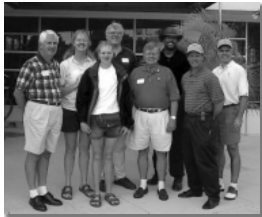
Hannah's Cure PH golfers and helpers.