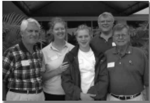
PHA was well represented.

November 2, 2001, saw 84 golfers including PHA officers, friends and family gathered together for Hannah's Cure PH Golf Tournament in Miami, Florida. Over $22,000 was raised in the second year of this successful event.